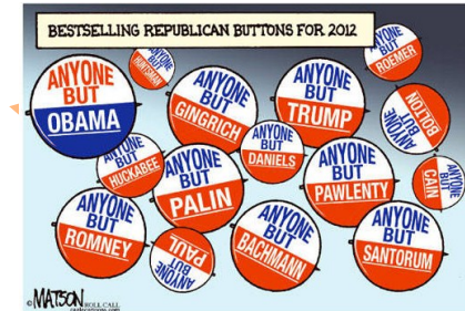
2012 Shaping up to be an interesting election

votes. Once the presidential candidate reaches 270 votes or more from the Electoral College, they be- come President